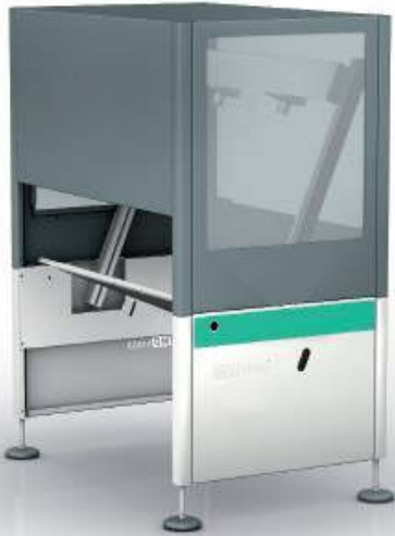
Preform Monitoring PECO Lux

integrate into existing production lines. The camera-based testing system registers quality drifts and colour variations in preforms in continuous mode. Smart software based on self-learning functions makes the system easy to operate. Preform inspection provides new perspectives in smart, cost-saving inspection procedures on preform production lines.