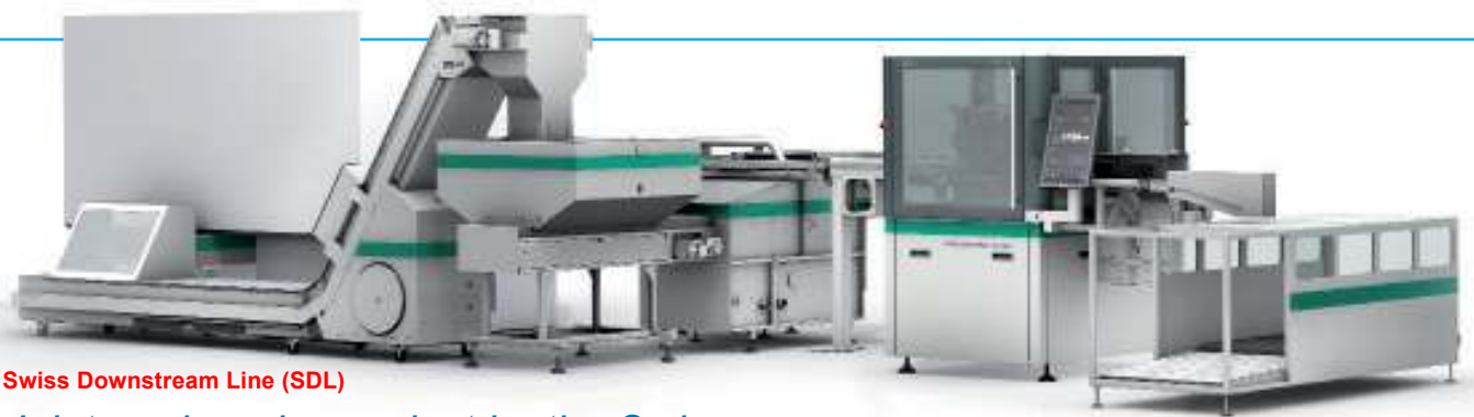
Swiss Downstream Line (SDL)

Joint engineering project by the Swiss partnership for the plastic packaging industry