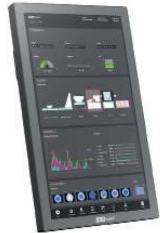
Vision Control Center V5

After the product launch, visitors took an opportunity to take a tour around the production halls at IMD and the wide variety of products in the company's range. This also included the IMDvista TWIX double conveyor study concept, with an anonymous questionnaire for visitors to give their own ideas and suggestions – customer relations take very high priority at IMD vista. All four companies were extremely satisfied with the event, and especially the Swiss partnership.