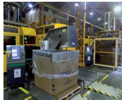
Inside the Acsur factory

Since the installation of these systems, the two companies Acsur S.A.